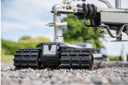
Illustration of the Robot Trolley mounted on the side members of the caravan: